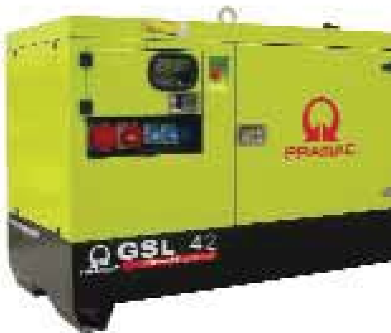
Analogue instrumentation and sockets